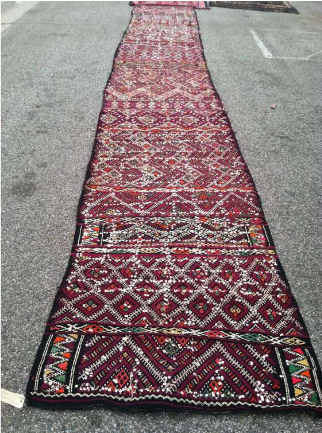
Wedding Moroccan Wedding runner with sequins: size 22' x 3' $350