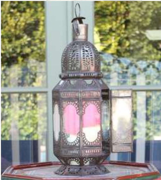
Clear glass Lanterns