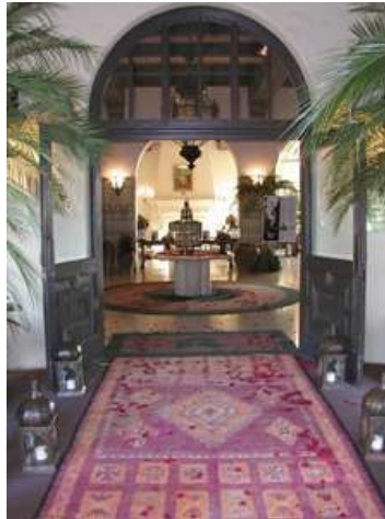
Marrakech 8' x 6' $150