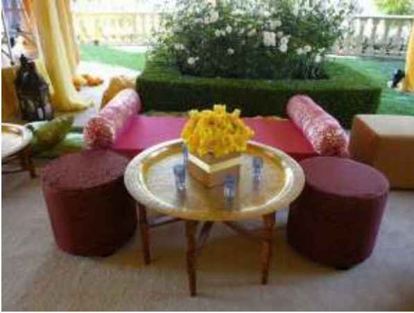
Brass Tray Table 36"D x 20"H $75