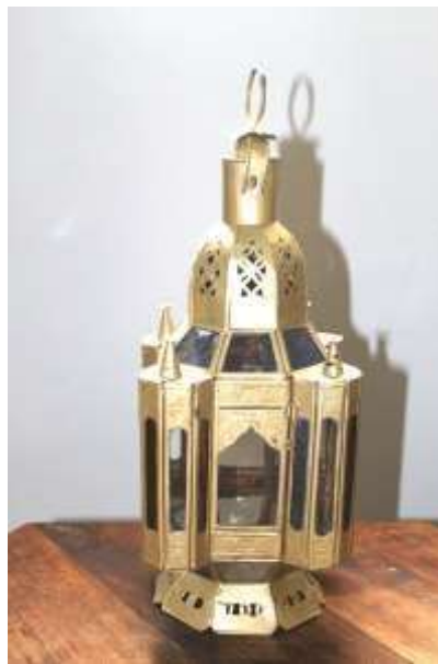
Gold Marrakech lanterns KW06 19"H $19