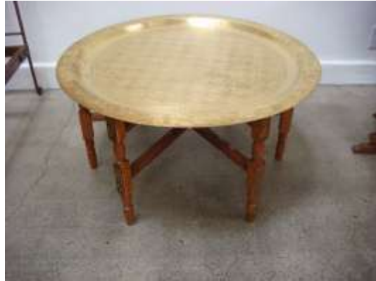
Brass Tray Table 44"D x 20"H $150