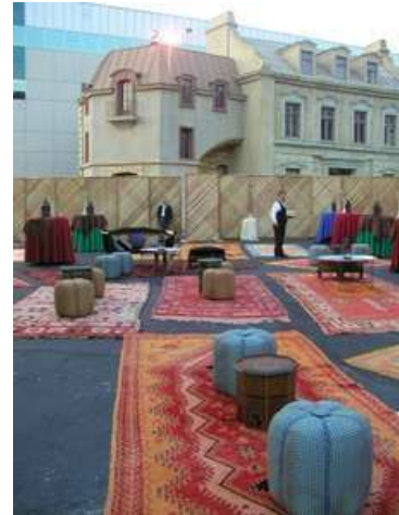
Rabati 6' x 15' $ 250