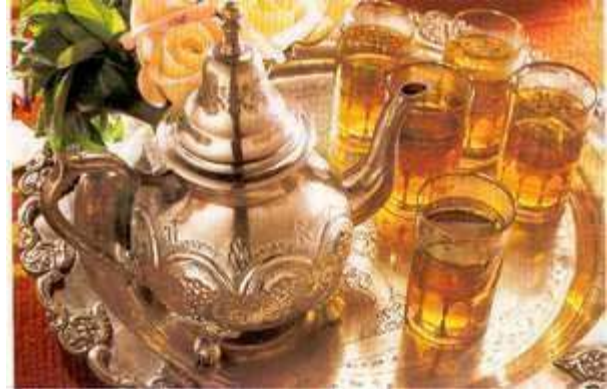
Kettle, Tajine, Samovar 30"H from $49