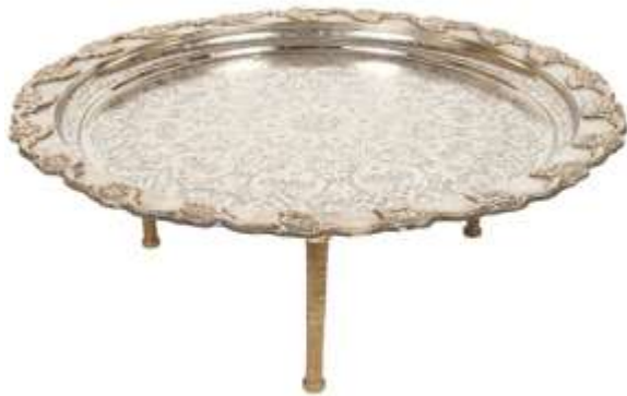
Silver tray 20" D. $ 49