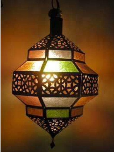
Moon Lantern 12"H $25