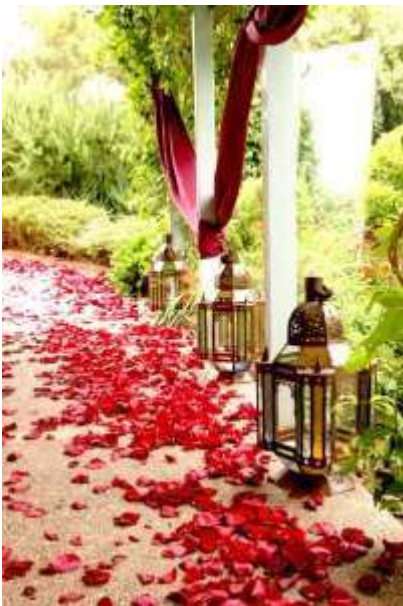
Marrakech lanterns 26"H $39