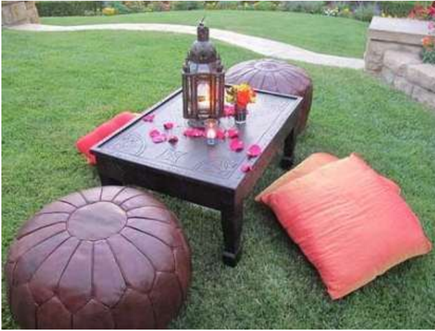
Berber hand carved tables 30" x 32" x 16"H $59