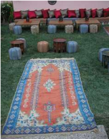
Taznacht 9' x 5' $150