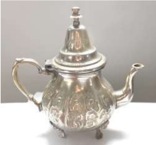
Silver teapot $15