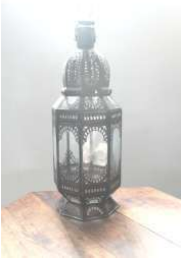
Moorish Clear Lanterns 21”H x 7”W $29