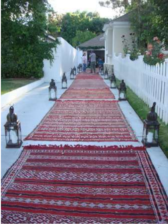
Marrakech 16' x 6' $350