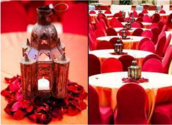
Marrakech lanterns 19"H x 7"W $25 KW06