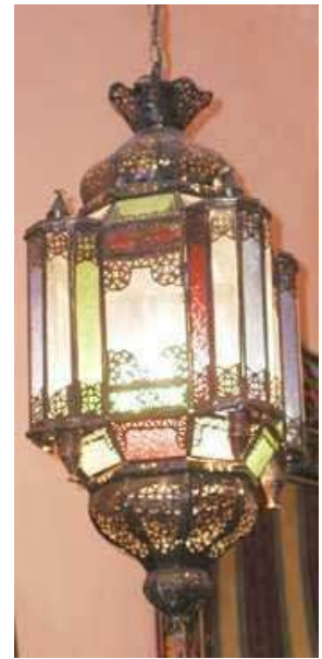
33"H x 13"W $65