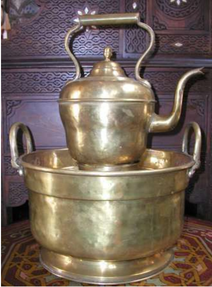
Kettle and basin 30"H $49