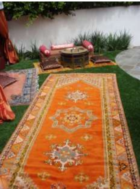
Marrakech 12' x 6' $200