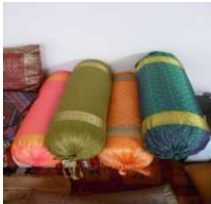
Silk Bolsters Pillows 28" x 28" $29/each