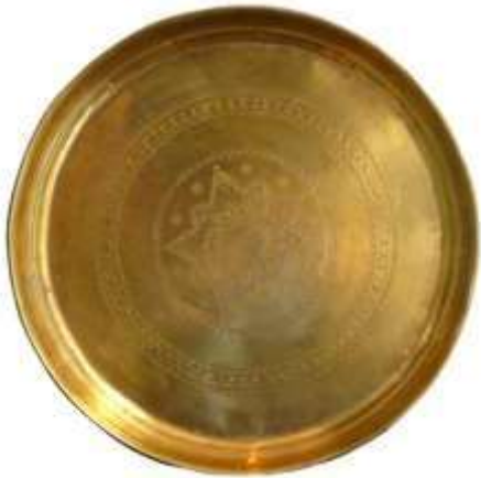
Brass serving tray 20"D $35 TR1