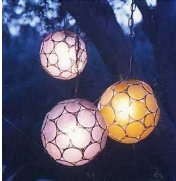
Colored Bowl Hanging Lanterns 12"H $ 35