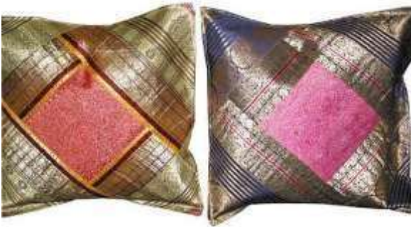
Small Silk Pillows (various colors) 15" x 15" $9/each